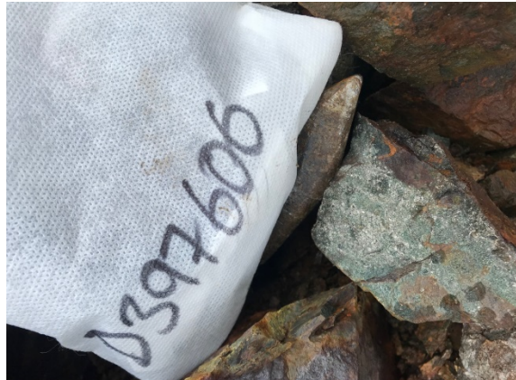
Figures 3-4. Chulitna Project - Field Exploration Works