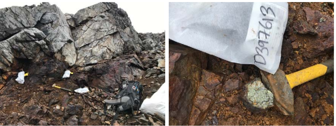
Figures 1-2. Chulitna Project – Field Exploration Works

The review of historical data at Partin Creek identified previous rock-chip sampling along 600m of exposed skarns and veins with anomalous gold, copper and silver mineralisation. The mineralised exposure at Partin Creek occurs along a steep south facing spur ridge that extends for ~1.4km, whilst airborne geophysical data shows a strong continuity of the lithologic basalt/limestone host to Partin Creek mineralisation that extends for ~10km within the project area.