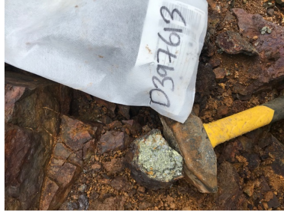
Figures 1-2. Chulitna Project – Partin Creek Prospect Field Exploration Works

The initial field exploration sampling and geological mapping program was planned to duplicate the known gold occurrences at Partin Creek, to target a robust and coherent gold system with considerable strike length.