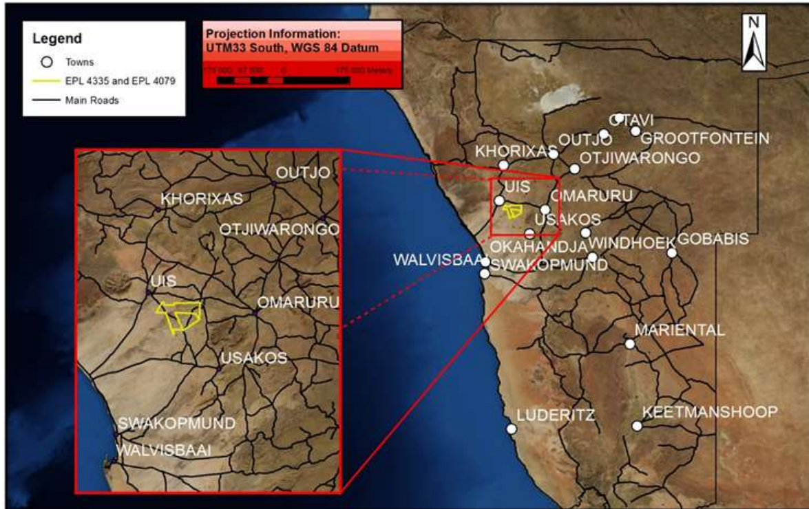
Figure 2: Location Map of the Area 51 Graphite Project in Namibia

ACN 147 324 847 ABN 50 147 324 847 Level 4, 100 Albert Road, South Melbourne, VIC 3205 Phone: (03) 9692 7222 Fax: (03) 9077 9233 Email : generaladmin@baru.com.au Website: www.baru.com.au