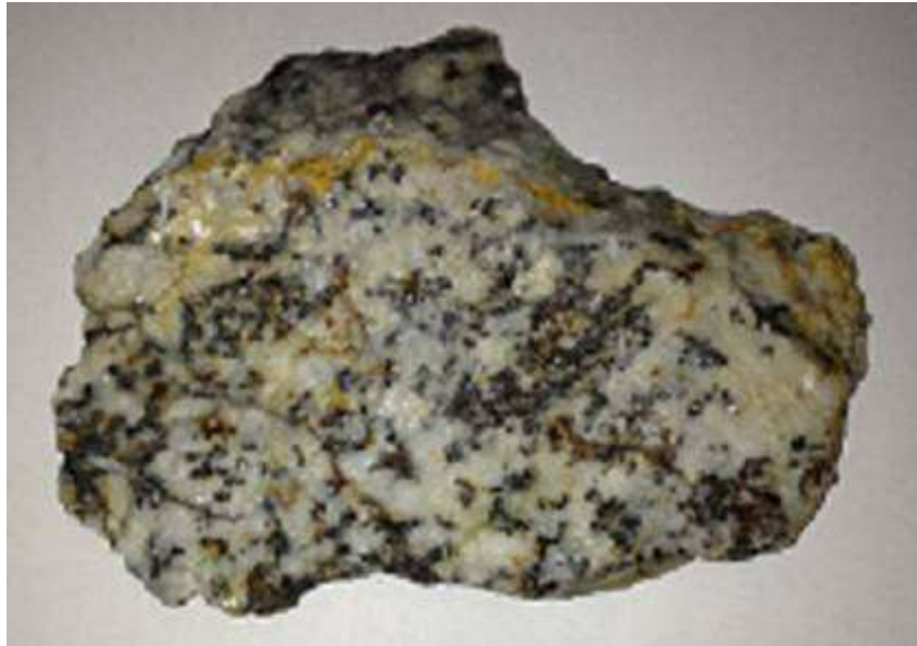
Figure 1: Graphite Sample taken from site

The Directors of Baru Resources Limited ('Baru', 'BAC' or 'the Company') provide the following update on the progress of the Area 51 Graphite Project exploration activities: