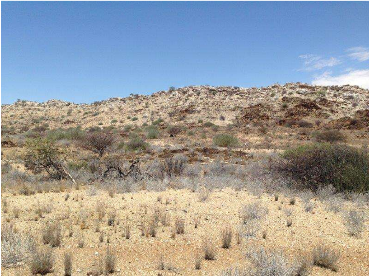
Figure 4: Outcropping formation at Area 51 Graphite Project

Highlighted in figure three above, is the distribution of indicated Graphite grade distribution by colour, where red represents the highest values and blue represents the lowest.