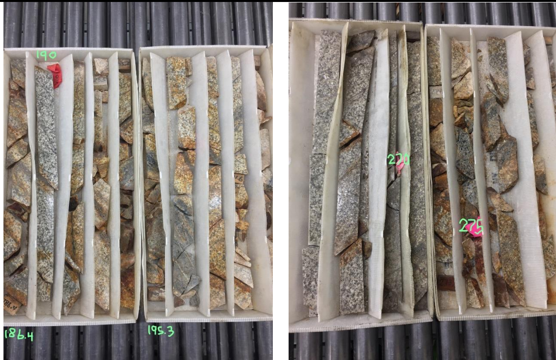
Figures 1-2. Coal Creek Prospect Historical Drill Hole DDH-25 (showing selected greisen interval)