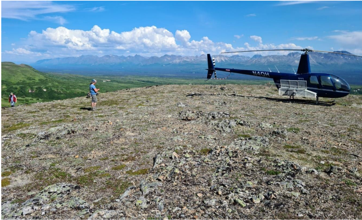
Figure 1. Chulitna Project – Coal Creek Prospect (Outcropping Granite with Lithium Mineralisation)

Coal Creek, with preliminary evaluation works confirming lithium mineralisation from historic drill core at the Coal Creek prospect.