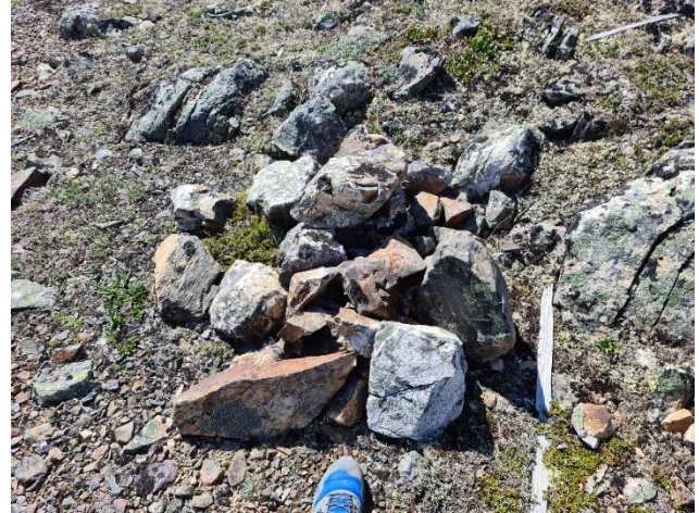
Figures 2-3. Chulitna Project – Coal Creek Prospect (Outcropping Granite with Lithium Mineralisation)

The Coal Creek prospect granite consists of at least two texturally and chemically different units – a seriate granite porphyry which is intruded at depth by a fine-grained equigranular to porphyritic biotite (lithium) granite. The seriate granite outcrops at surface and forms a small resistant knob. Greisen alteration is the main type of alteration, and with the mineralization, are centered in and above the cupola of the biotite granite in the upper seriate granite unit along an elongate dyke like granite porphyry body.