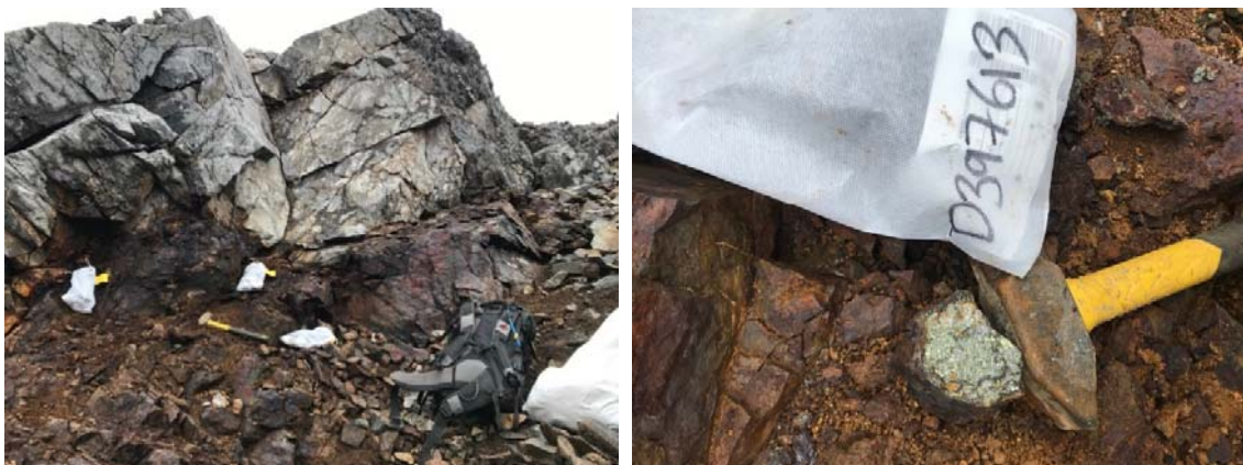
Figures 1-2. Chulitna Project – Field Exploration Works

The review of historical data at Partin Creek identified previous rock-chip sampling along 600m of exposed skarns and veins with anomalous gold, copper and silver mineralisation. The mineralised exposure at Partin Creek occurs along a steep south facing spur ridge that extends for ~1.4km, whilst airborne geophysical data shows a strong continuity of the lithologic basalt/limestone host to Partin Creek mineralisation that extends for ~10km within the project area.